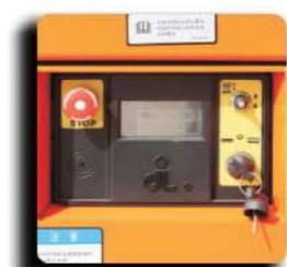
Touch Display Screen