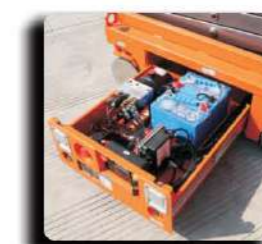
Slide Out Tray